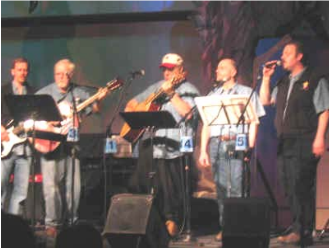
Earthen Vessel public debut at the Juneau Folk Festival 2003