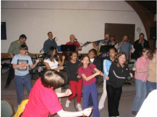
Earthen Vessel plays music at youth night April 2004..the kids are dancing