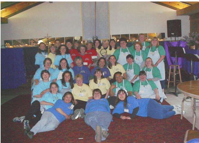
June 2003 women's team