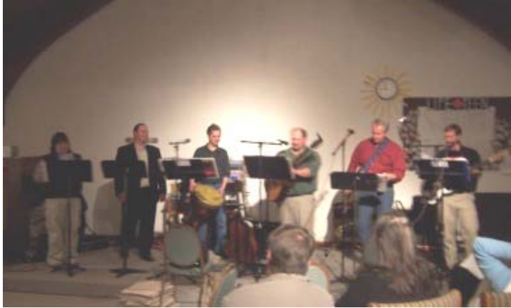
Earthen Vessel playing at the Thanksgiving Gathering 2007