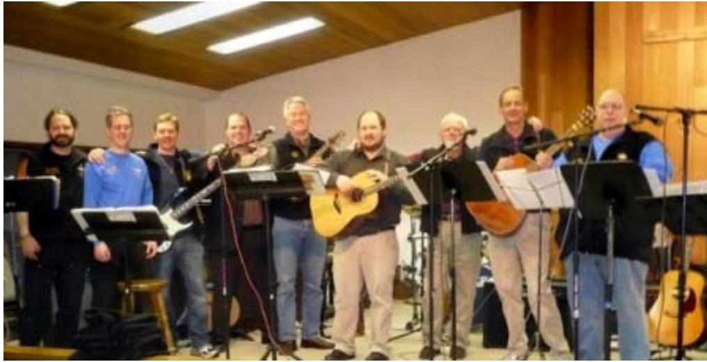
At Church of the Nazarene 2008