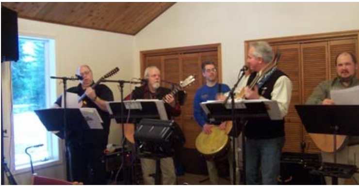
Earthen Vessel music ministry at St. Brendan's 2008