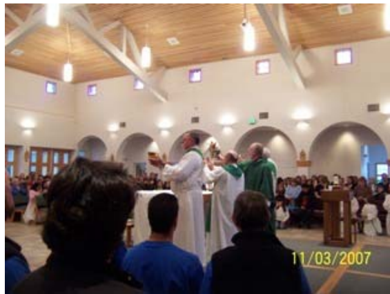
Men's return mass at Sacred Heart Church/Wasilla

ACTS Mission Board minutes from Sept 2007 are posted on the ACTS website at www.actsinaction.com .