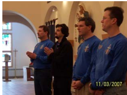
Wasilla Men's return last year.